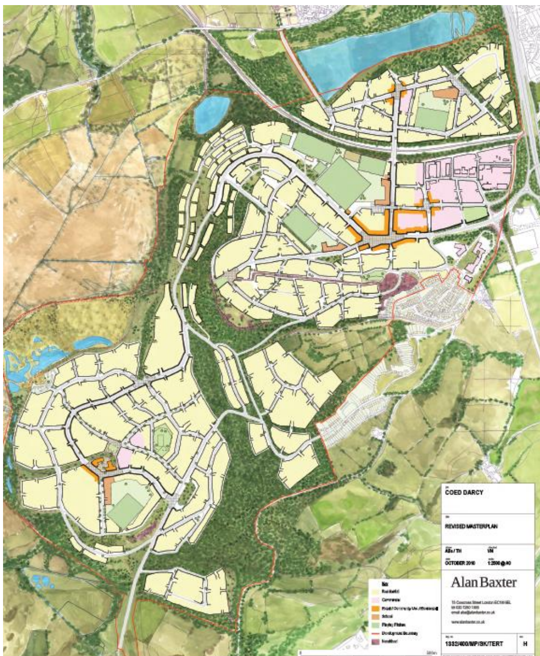
Figure 1 : Approved Masterplan